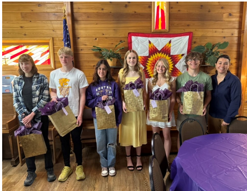
Prayers and the best in the future!